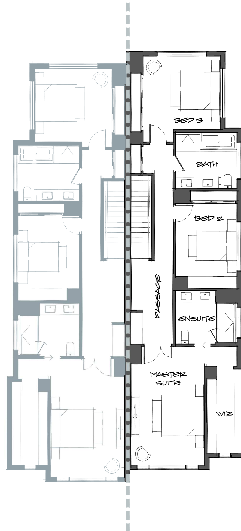
First Floor Marketing Plan